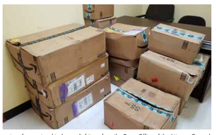
TYPHOON RELIEF CONTRIBUTIONS. The Office of the Attorney General received an outpouring of support and typhoon relief items from the Guam Office of the Attorney General and the Conference of Western Attorneys General (CWAG) shortly after Super Typhoon Yutu ravaged the Commonwealth on October 24, 2018. The OAG staff and attorneys could not be more thankful to our colleagues in Guam and throughout the United States for their act of kindness and generosity.