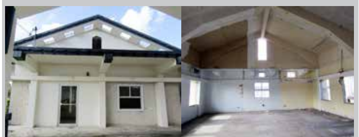
Criminal Division Building 1 renovation project:

Including new cases for 2017, the Criminal Division currently handles 563 criminal cases, 23 Juvenile matters, and 6,082 traffic cases. The Criminal Division also participated in 13 Appellate filings, argued 6 cases before the Supreme Court and handled Parole Hearings for 16 petitions and 3 revocations.