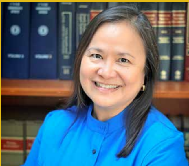
Lillian Tenorio Deputy Attorney General

Under the direction of the Attorney General, the Deputy Attorney General supervises the implementation of OAG’s goals and objectives. Primary responsibilities include the oversight of Civil and Criminal Divisions, administrative functions, and legislative review. The following highlights for 2017 include supervision in the following areas: