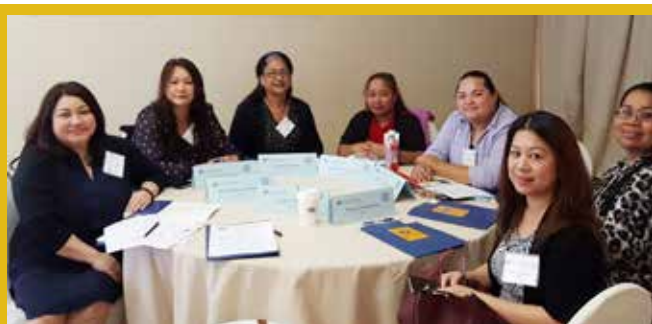
Administrative staff attended the Paralegal Skills Training sponsored by the National Attorneys General Training & Research Institute (NAGTRI).