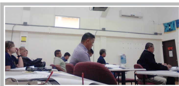
Investigators from the Attorney General's Investigative Unit attended the ATF training held at the Department of Public Safety.