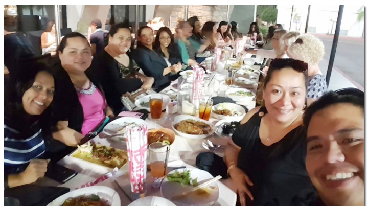
Victim Advocates and Legal Assistants attend the International Summit and Training on Violence, Abuse, and Trauma Across Lifespan through full scholarships sponsored by IVAT ALSO.