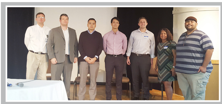
Assistant Attorney Generals conducted a workshop of the CNMI Procurement Regulations for the Office of Grants Management.