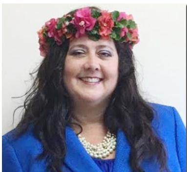
Michele Harris Chief Prosecutor

The Criminal Division is in charge of prosecuting criminal offenses pursuant to Article III, Section II of the Commonwealth Constitution. Ensuring that justice is served while balancing the safety and welfare of the Commonwealth are essential functions of the Criminal Division and necessary for maintaining a civilized society.